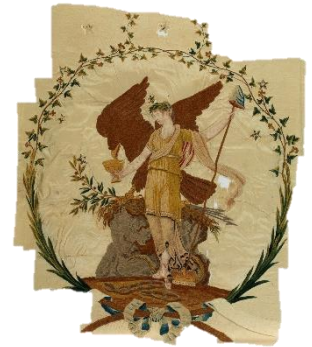
Liberty Banner, 1790s

Analysis: Have students examine this question by exploring the symbols shown in the 1790s Liberty Banner. A critical-thinking outline for this task is included at the end of this guide.