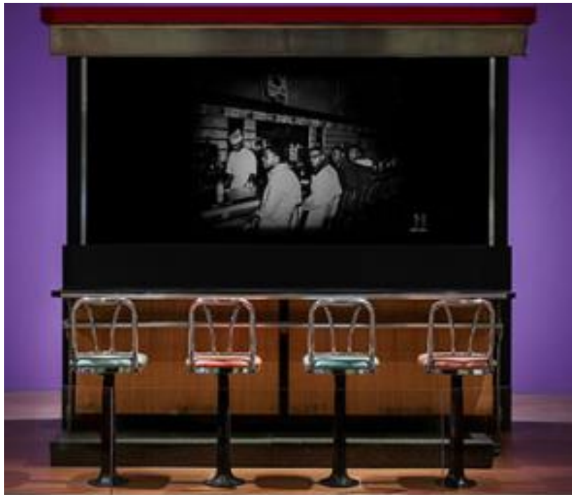
Lunch counter section from Greensboro, North Carolina, sit-ins, National Museum of American History, Smithsonian Institution