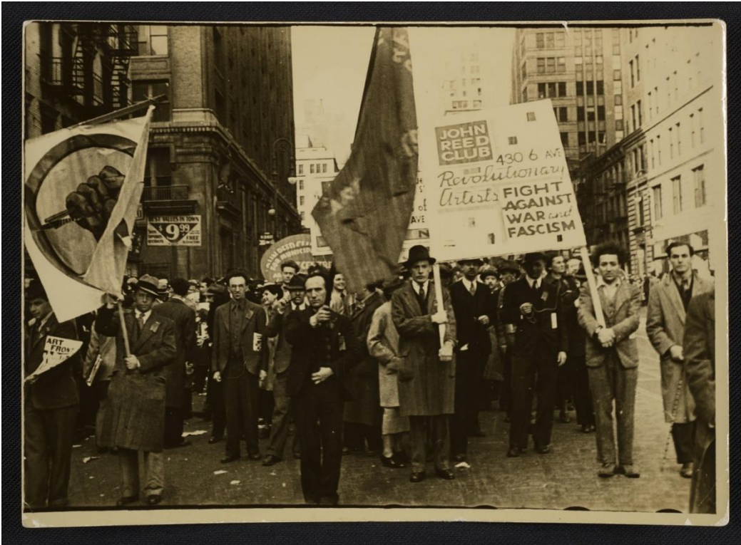
Louis Lozowick papers, 1898–1974, Archives of American Art, Smithsonian Institution